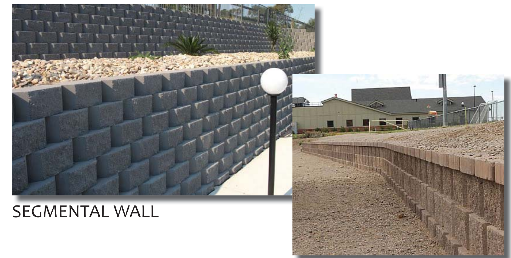
RETAINING WALL - PRECEDENT IMAGES